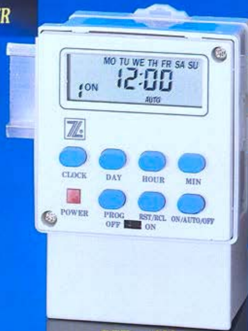
PET — 009