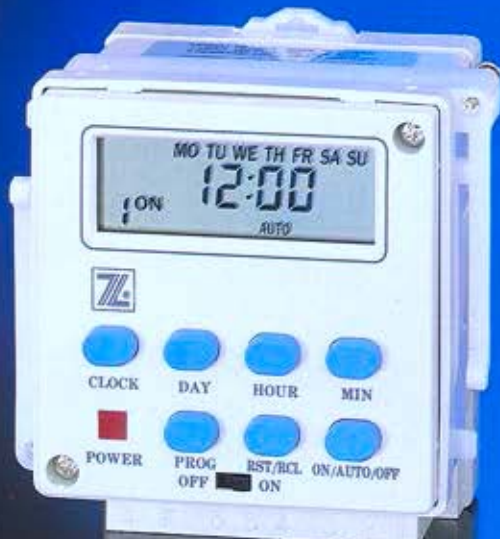
PET — 009