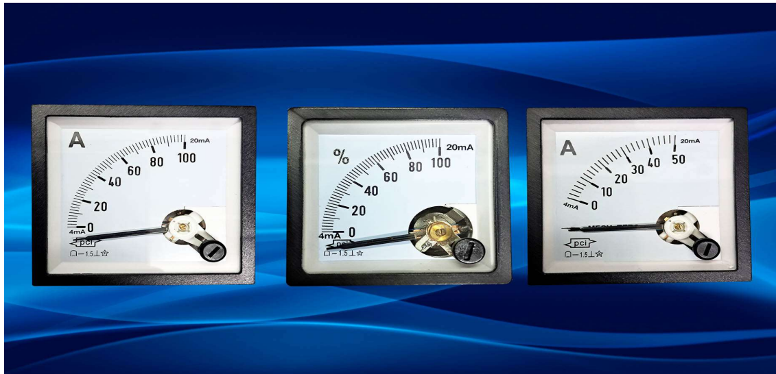
Moving Coil meter 4-20mA DC