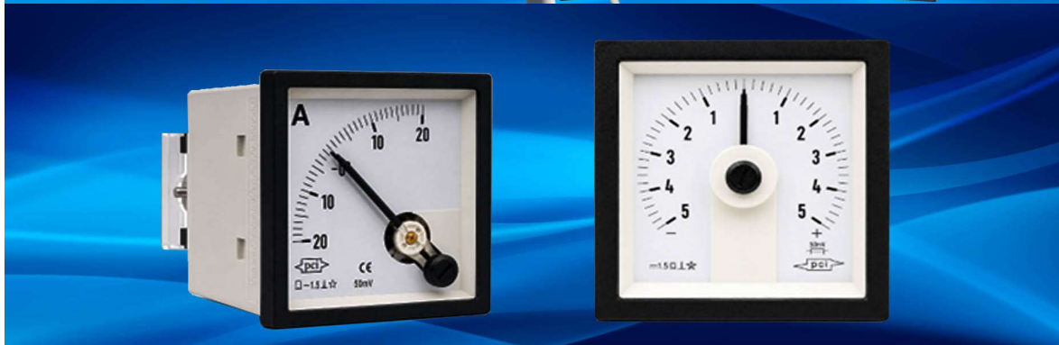
Moving Coil meter 50mV Center zero DC